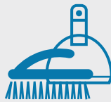
SHOVEL, ICE SCRAPER, SNOW BRUSH