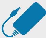
CELL PHONE, CHARGER